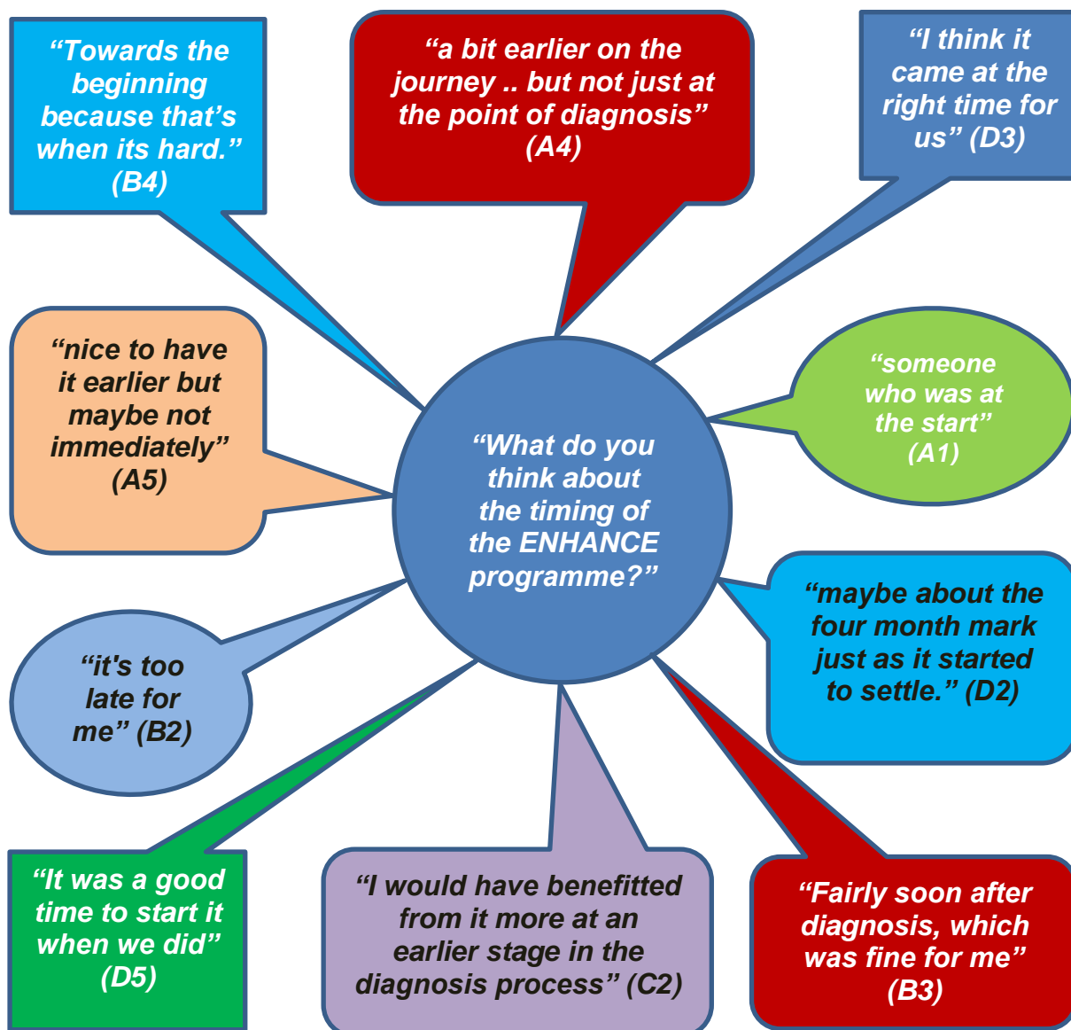
Figure 8: Parent participant views on the timing of the ENHANCE intervention.